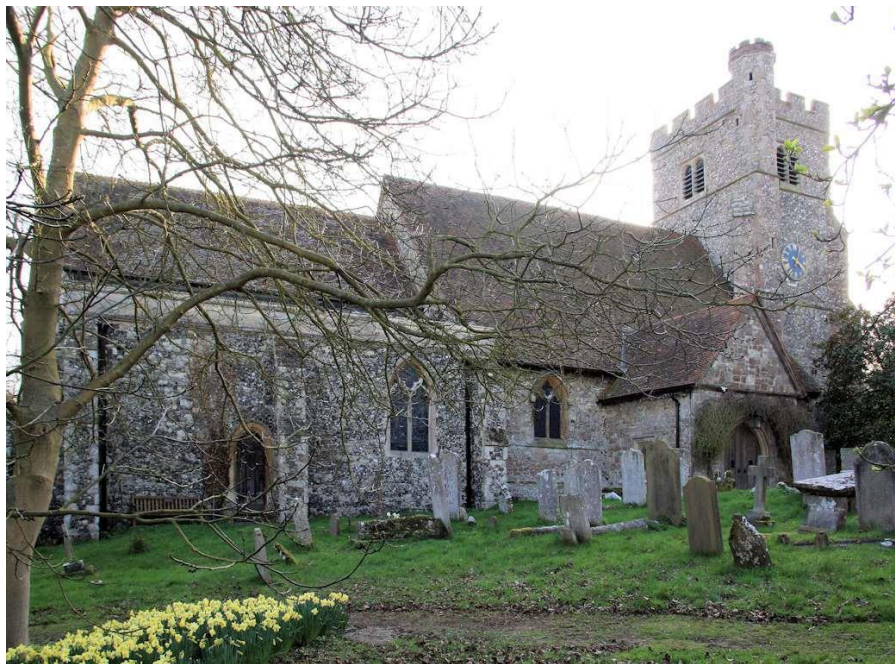
The Church of St Peter & St Paul

Details of all our services held at the Church of St Peter & St Paul can be found on our school website.